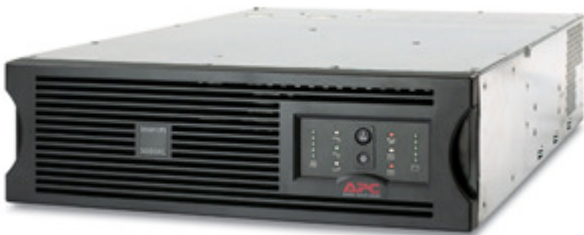
APC Smart-UPS XL 3000VA RM 3U 230V Part Number: SUA3000RMXL3U