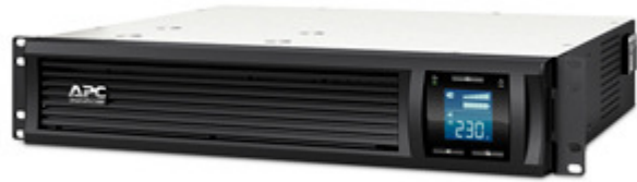
APC Smart-UPS C 1000VA 2U Rack mountable LCD 230V Part Number: SMC1000I-2U