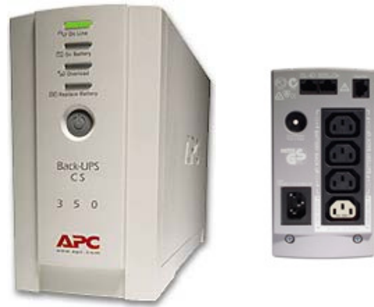
APC Back-UPS 350, 230V Part Number: BK350EI

Technical Specifications Product Overview Documentation Software & Firmware Options Ratings and Reviews