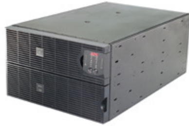
APC Smart-UPS RT 8000VA RM 230V Part Number: SURT8000RMXLI