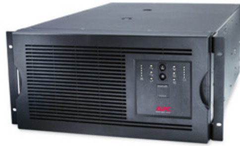
APC Smart-UPS 5000VA 230V Rackmount/Tower Part Number: SUA5000RMI5U